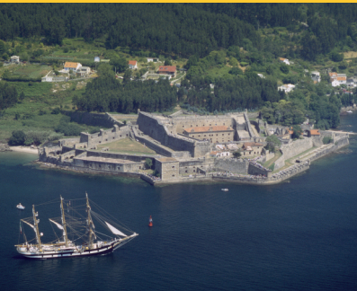
From the opposite shore we have excellent panoramic views of the Castle of San Felipe and the estuary of Ferrol, ideal for adventure sports and sailing.