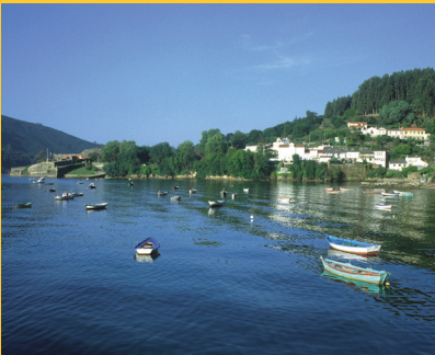
The village of San Felipe is ideal for a quiet stroll, to admire the beautiful views over the estuary and enjoy the area's excellent seafood.