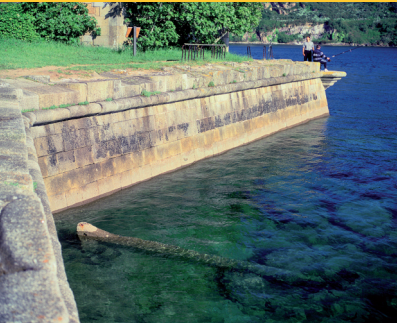
The seabed still preserves the remains of the anchors that held a chain in place to close off the mouth of the estuary, stretching between the castles of San Felipe and San Martiño to prevent enemy vessels from entering.